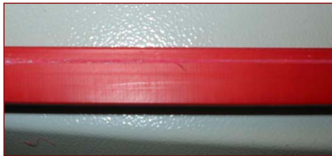
A severe groove in cutting stick can keep even a sharp blade from going all the way through the stack